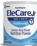
EleCare Jr® For Ages 1 and Up