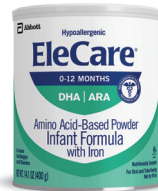
EleCare® For Infants 0–12 Months

Call 1-855-217-0698 or visit pathwayreimbursement.com