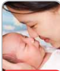
Expressed Preterm Human Milk* (PTHM)