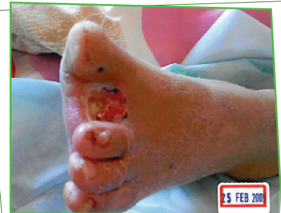
Figure 2 One month after the surgical amputation, the wound still showed no signs of healing and appeared to have become infected.