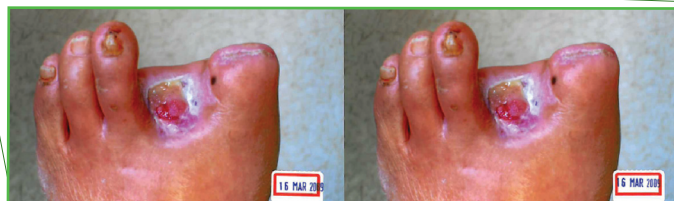
Figure 3 Six days after Juven medical nutrition therapy was begun, there was evidence of wound granulation.