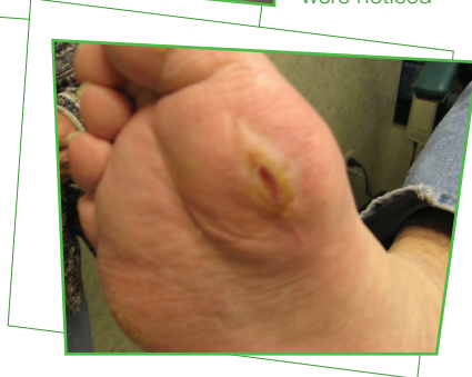
Photo #3 After a total of three and a half months on Juven, the wound was nearly closed