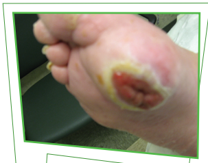
Photo #2 October 2007: 2 weeks after Juven initiation, signs of healing at the wound site were noticed

When Mr. S returned to the wound care center for follow up (December 2007), the wound had closed, and the ulcer surface has diminished to 1.5 inches (L) x 0.5 inch (W). (see photo #3) The wound care team decided that, because of the degree of healing, neither surgery nor hyperbaric therapy was required.